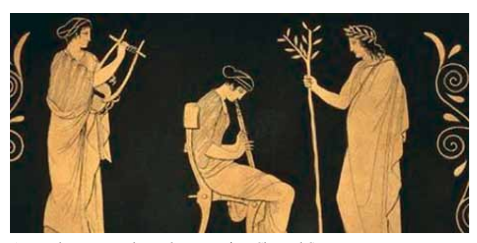
A musical competition depicted on a vase from Classical Greece.

Where does all this thing about money and so forth