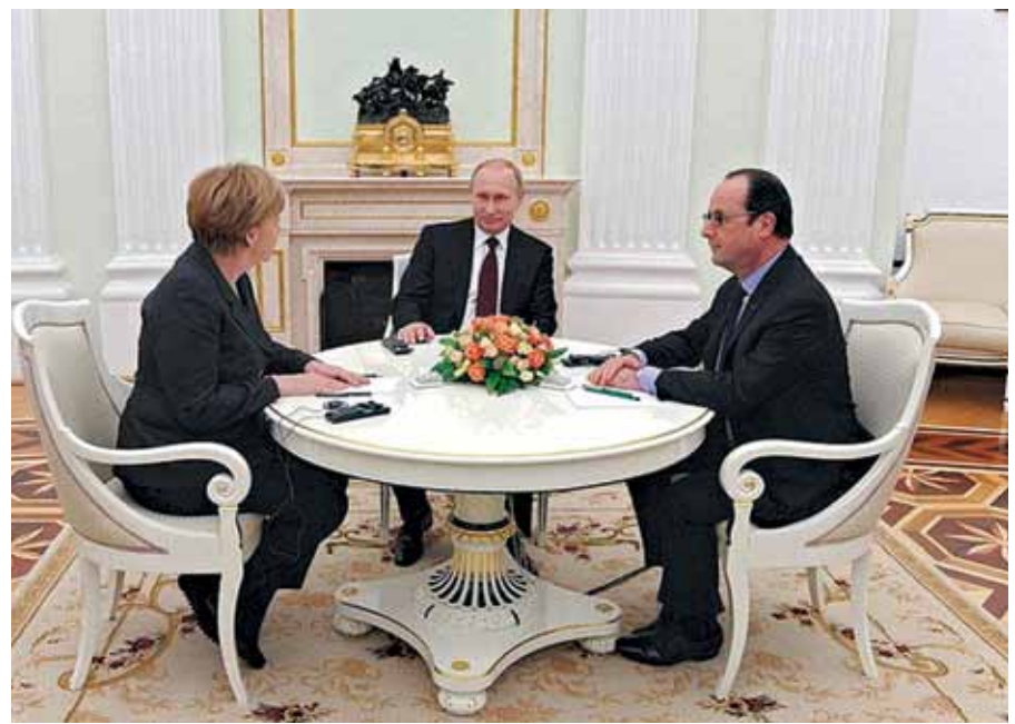
Russian Presidential Press and Information Office