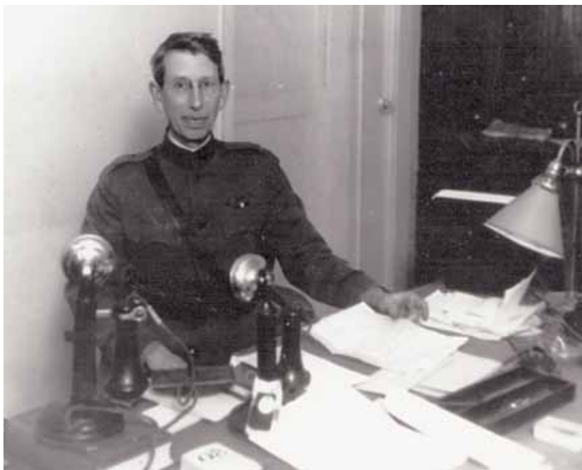
Hoover mentor Ralph Van Deman (1865-1952), known as the "Father of American Military Intelligence."

As part of this coup, Edward Bernays and Walter Lippmann created modern "public relations," or impe-