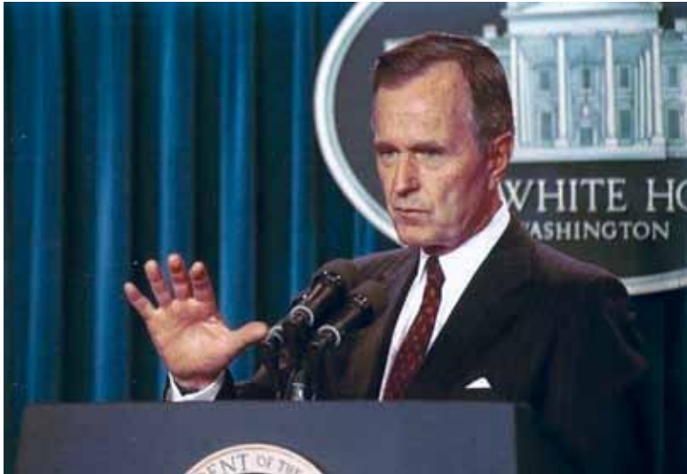
George Bush Presidential Library and Museum