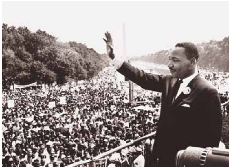
Rev. Martin Luther King, one of Hoover’s key targets, addresses the August 2, 1963 March on Washington.

The Church and Pike Committee Congressional Hearings of 1975-76 revealed that during the FBI’s COINTELPRO programs, and the parallel programs run by Army Intelligence, the CIA (“Operation Chaos”), and the NSA (Operation Minaret), dissident political leaders in the United States were subjected to numerous false arrests and imprisonment, defamation to family, friends, and potential associates, burglaries and thefts, unauthorized wiretaps, bugs, and NSA surveillance, assassinations, and gang-versus-countergang orchestrated murders. FBI informants flooded targeted organizations—alerted to transcribe personal flaws, gossip, organizational intrigue, family, sexual, and financial practices and problems—all for exploitation by the FBI