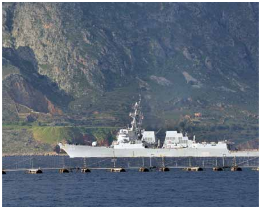
The context for Greek Prime Minister Alexis Tsipras’s July 13 announcement of a deal on the Greek debt (left): NATO’s deployment in Greece. Here, the USS Truxton is shown departing the Marathi NATO pier facility in Greece.