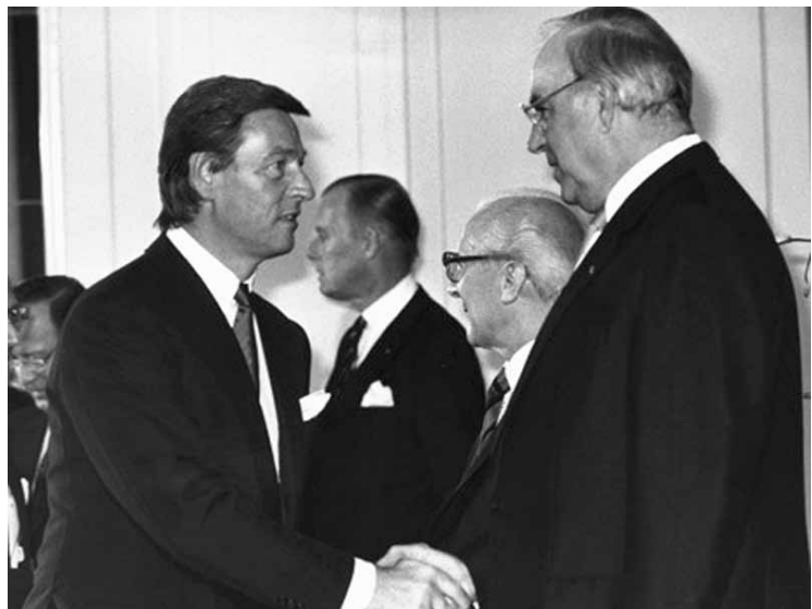
Deutschebank chairman Alfred Herrhausen greets German Chancellor Helmut Kohl.

You had the same thing happen again in the 1980s. Remember that President Ronald Reagan was a close collaborator of Lyndon LaRouche around the project to realize the Strategic Defense Initiative. He was targeted for assassination; he barely survived the assassin's bullets. But the diminished health that Reagan suffered for the remainder of his Presidency effectively opened the door for the Bush apparatus to move in. First, during the Vice Presidency of George H.W. Bush; later, during his