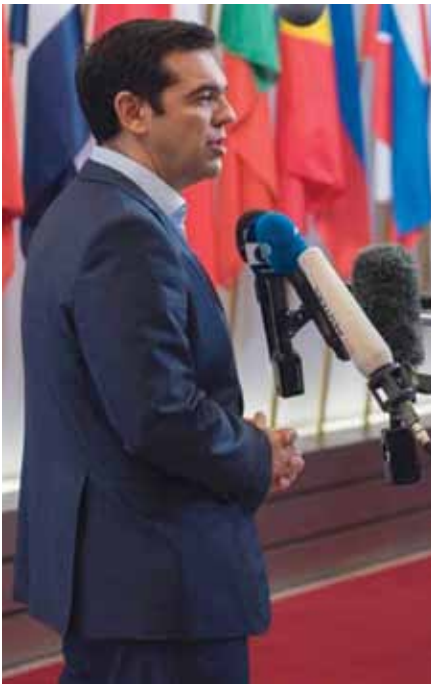
Tsipras twitter account

Taking for one moment the developments around Greece, and Mr. LaRouche’s emphasis on the long arm of the British Empire, which in this case largely worked through German Finance Minister Schäuble: What actually happened is that, over the past few days, the entire trans-Atlantic system reached a potential breakdown moment. Greece did not pay the IMF loans that came due on June 30, but they have only a one-month