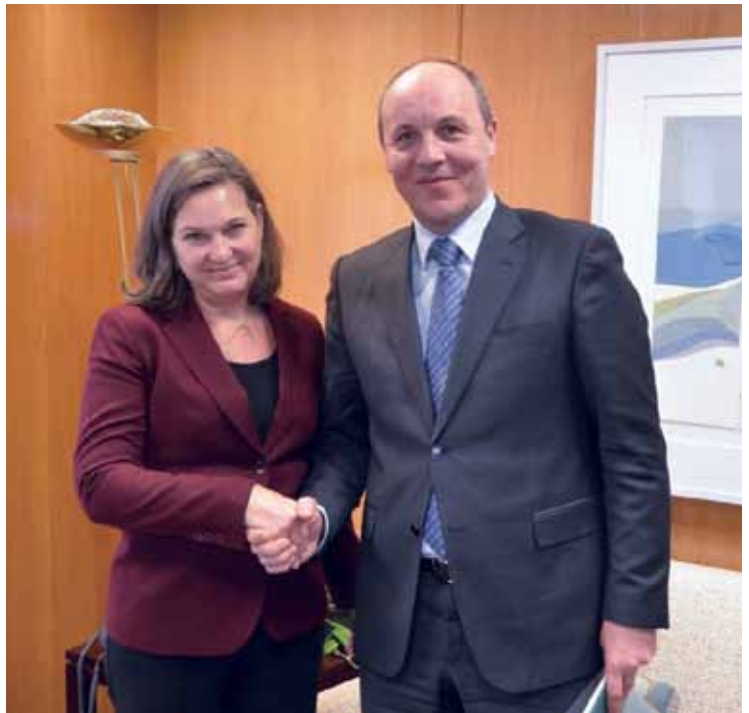
Ukrainian Embassy of Washington

Victoria Nuland was the poster girl for that operation, but it was much broader support than that; it was British. So, there was a military coup, using neo-Nazi forces, simply because President Viktor Yanukovych concluded that signing the eastern partnership deal with the European Union would be completely against the national interests of Ukraine. All that's followed from that point, has been a hysterical reaction over the fact that some people in Ukraine decided to act in the interest of their country, and walk away from something that would have been basically the death of the Ukrainian economy and the Ukrainian people.