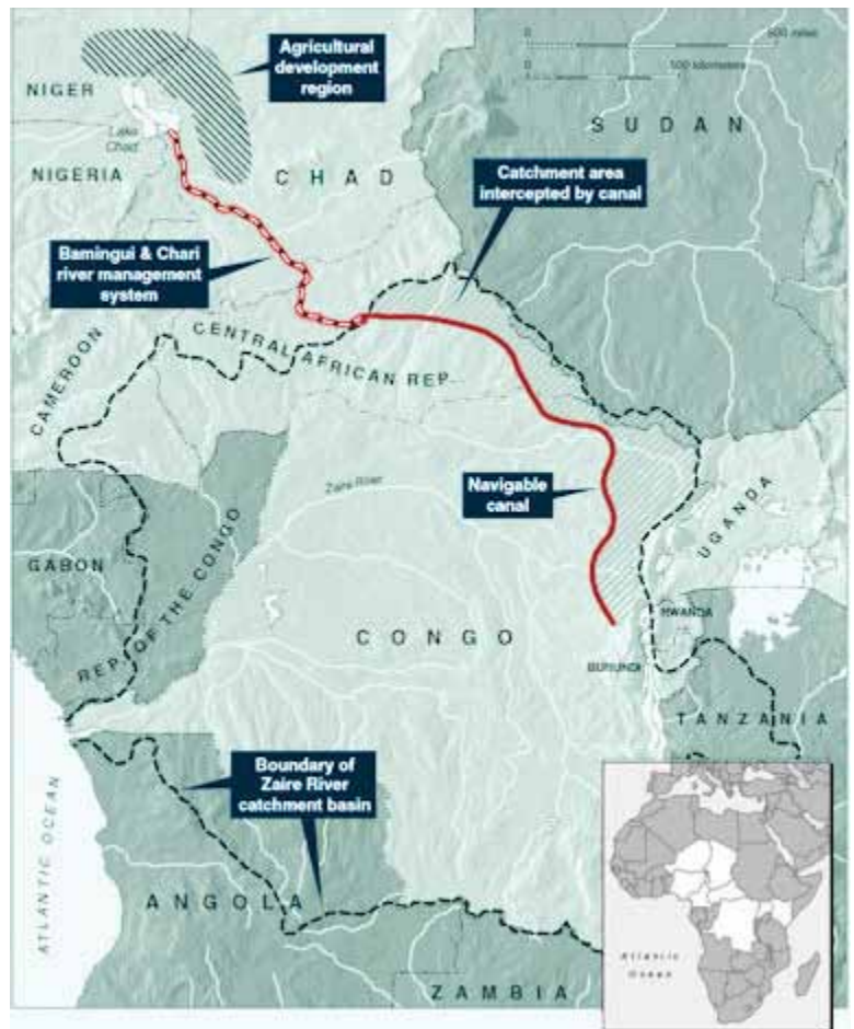
Transaqua will bring approximately 100,000 cubic meters (81 million acre feet) of freshwater from the Congo River Basin, through 2,800 km of navigable canals, to Lake Chad.

the last glacier melt, and 400,000 km 2 in 4000 B.C. It was considered to be one of the largest lakes in the world, but since 1963, has shrunk by 90%, from a surface area of 25,000 km 2 . While many estimate today’s size of the lake, which consists of northern and southern pools of water separated by large sand dunes called the Great Barrier, at less than 2,000 km 2 , Mohammed Bila, a geologist who has been examining surface waters through remote sensing for the LCBC since 2004, believes that due to heavy rains in 2012, the lake may now be as large as 4,500 km 2 , with some water in the northern pool for the first time in many years.