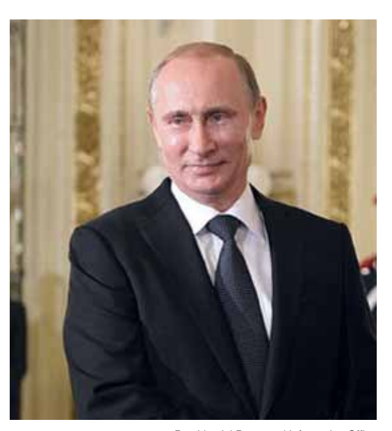
Russian President Vladimir Putin

The bank and the Currency Pool, with combined resources of $200 billion, lay the foundation for coordinating a macroeconomic policy between our nations.