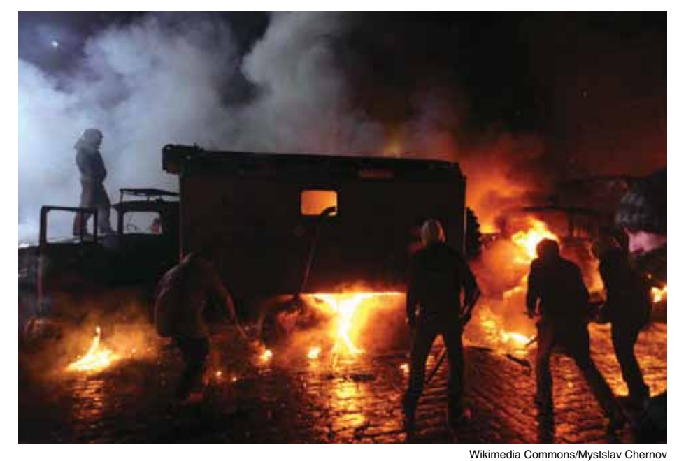
Blazing barricades in Kiev, Jan. 19, 2014. Western press coverage has almost universally attributed the violence to "police brutality," while U.S. Sen. John McCain and others court the anti-Semitic leader of the Svoboda party.

kraine Enters the Hot Phase ( in fore had seen a major escalation aidan paramilitary units on Hrua. They attacked police barricades overnment buildings, setting po-Molotov cocktails, and shrouding black smoke from piles of burning . This was no spontaneous reacegulating demonstrations, passed an. 16, Vitrenko explained, but lation of the deliberately targeted un nearly two months earlier. would be it: the bird in the Ukraine was pre-determined. nomic, first and foremost; that ing up the domestic market b iffs 70% for all covered types meant a flood of cheap, c Ukraine, blocking those of o industry. All possibilities for manufacturing would have be West has no use for us as a conto be a recipient, not a partner, omy would have quickly defi