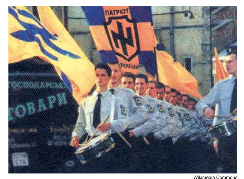
The youth group of the Social-National Party of Ukraine, on the march with their swastika banner in Lviv in 1999. The party's name evoked that of the German National-Socialist ("Nazi") party. The swastika was dropped in 2003 and the party was renamed Svoboda in 2004.

been savaged (with Russia ending its free-trade regime with Ukraine, to prevent its own markets from being flooded via Ukraine), and the European markets' players would have grabbed for Ukraine's agricultural and raw materials exports. The same deadly austerity regime as has been imposed on the Mediterranean states of Europe under the Troika bailout swindle would have been imposed on Ukraine.