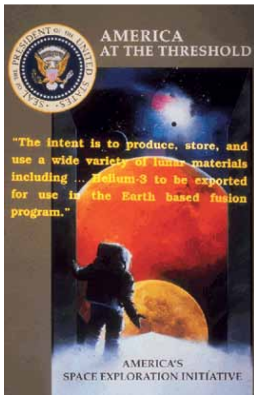
This 1991 Presidential report underlined the potential of Helium-3 for an Earth-based fusion power program. "What happened?" asked LaRouche. "We never actually moved to install that technology."

So the policy is to kill people, to lower the numbers of people, and maybe, even by accident, extinguish the