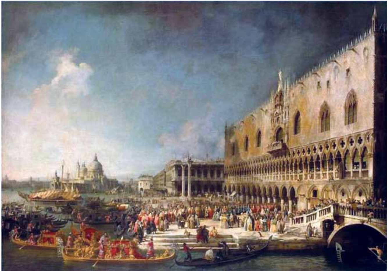
Venice: an epitome of the oligarchical principle. Shown is “The Reception of the French Ambassador in Venice,” by Canaletto (1745).