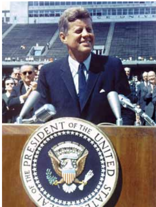
President Kennedy at Rice University, Sept. 12, 1962: "We choose to go to the Moon in this decade. . . . And as we set sail we ask God's blessing on the most hazardous and dangerous and greatest adventure on which man has ever embarked."

In his first political speech, to the American Legion