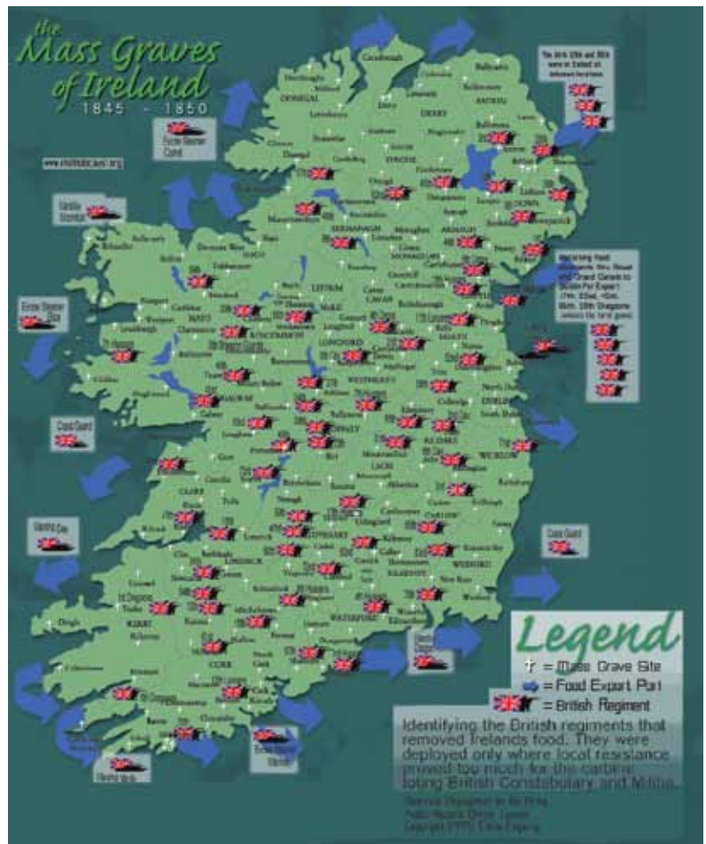
Union Jacks indicate British regiments enforcing the export of food from starving Ireland in 1848. White crosses mark mass graves. JFK’s great-grandfather was driven to emigrate.

The 1847-48 “Great Famine” was known to the Irish as deliberate genocide under British Prime Minister John Russell, who stationed half of the British Army in Ireland to oversee the export of masses of food, and to keep the captive population quiet. Hunger, disease, and emigration in slave-like ships cut the population from 9 million to 2 1/2 million. The devastation forced JFK’s great-grandfather Patrick Kennedy to emigrate,