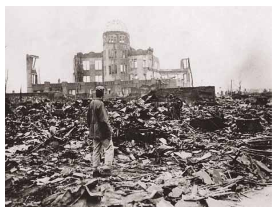
Only the combination of leading powers, such as the U.S.A., Russia, China, and perhaps others, could check the British imperial willingness to set off a global thermonuclear holocaust, LaRouche writes. Shown is Hiroshima after the nuclear bombing in 1945; after a thermonuclear war, life on Earth might not continue to exist at all.

Thus, to summarize the point of fact immediately here, the continuation of that original September 11, 2001 ("9-11") attack on the U.S.A., by the same leading, Anglo-Saudi institutions, has had a continually increasing impact among the targeted populations of a now rapidly growing rate of looting of nations. In the meantime, there has been a persistently accelerated rate of a currently downward trend present in most conditions of human life within the planet at large, a "super-crime" which is now the currently, openly declared intention of the British monarchy. This is a threat which is now intended, explicitly, as stated by the present Queen of England herself, to become the source of a currently measurable collapse in the population, that from a former level of about seven billions for the world population, to the stated, intended, early, present Brit-