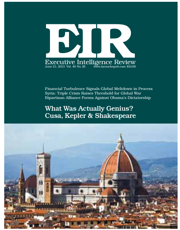
LaRouche's article "What Was Actually Genius? Nicholas of Cusa, Kepler & Shakespeare" appeared in EIR, June 21, 2013.

by some; however, to enable human beings on Earth to recognize the implications of that fact, we require a measure urgently needed for building up a much-needed escape of the population from the fraud inherent in the notion of Earth-bound sense-certainty.