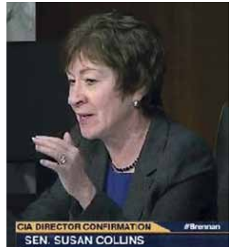
At the Feb. 7 Senate Intelligence Committee hearing on the confirmation of John Brennan as CIA Director, Senators (left to right) Carl Levin, Angus King, and Susan Collins sharply exposed the Brennan's lying hypocrisy on both Obama's killer-drone program, and the torture program he was involved with under the Bush Administration.

these targeted assassinations—something the United States condemns when carried out by other countries—has been oozing out in speeches by Administration officials, and leaks from various sources, over the past couple of years; but the more detailed arguments in the White Paper went further, exposing the flimsy, fraudulent nature of Obama's claim to the right to kill U.S. citizens accused of involvement in terrorism. He claims the right to execute an American citizen under three, virtually meaningless, constraints: