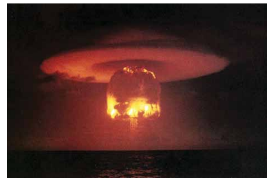
A thermonuclear Winter would mean the likely extinction of the human race. Shown is Castle Bravo, the code name of the first U.S. dry fuel thermonuclear bomb, detonated in 1954, and the most powerful nuclear device ever detonated by the United States.

This guy's a criminal. The Saudi kingdom is a mass of precisely that type of criminals. These guys deliberately did 9/11. Delib erately did it! We know the Saudi representative in the United States [Prince Bandar], who is now in charge of the Saudi intelligence operations, is the guy who orchestrated much of the organization of 9/11—personally. He was personally hands-on, in organizing the