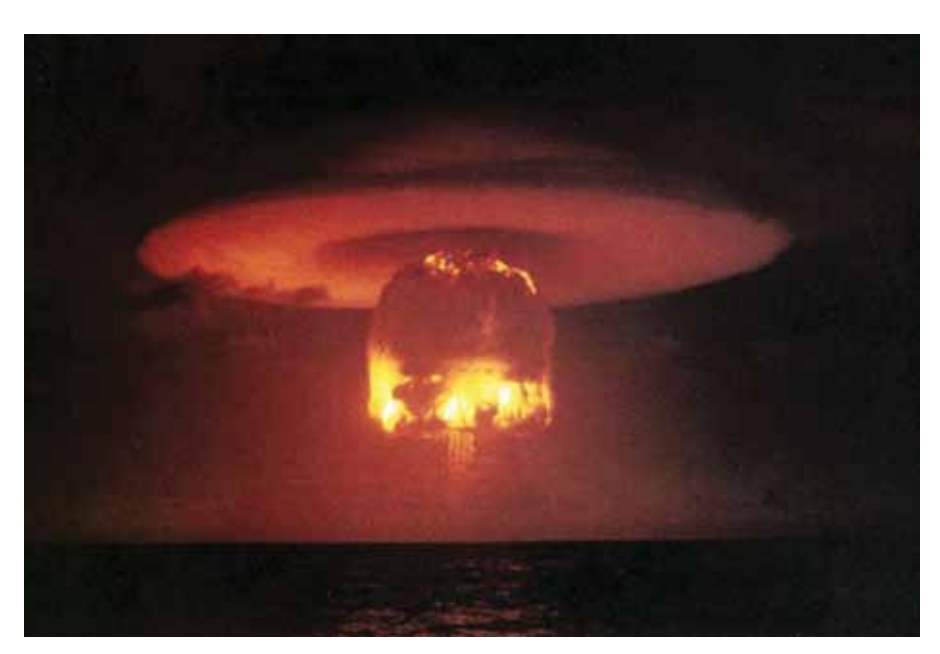
A thermonuclear Winter would mean the likely extinction of the human race. Shown is Castle Bravo, the code name of the first U.S. dry fuel thermonuclear bomb, detonated in 1954, and the most powerful nuclear device ever detonated by the United States.

And the key issue: Why do they hate me so much? Well, not just for SDI—that was a big one. They hated me because I attacked the drug-trafficking of the Queen of England. And now the Queen of England is now on a rampage, to reduce the population of the planet, quickly, from 7 billion people, to 1. And what the devil do you think is happening now, since that resolution was made?