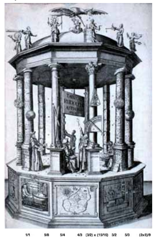
FIGURE 1 Kepler's Harmonies

Johannes Kepler (1571-1630), by insisting on the principle of causality (rejected by the reductionists then and now) gave modern science its first practicable, scientific conception of the astronomical universe. In his Harmony of the World, he extended the question "Why so, and not otherwise?" to the whole planetary system, showing that the conflicting evidence of the senses can only be resolved on a higher plane.