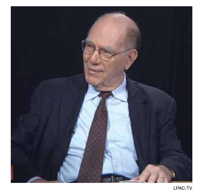
Lyndon LaRouche: "Only when you enter the doubt about your sense-certainties, do you actually begin to acquire genuine knowledge. And that's the function I believe we've tried to perform in these three weekly sessions."

So it is this factor of discovery, in that sense, which