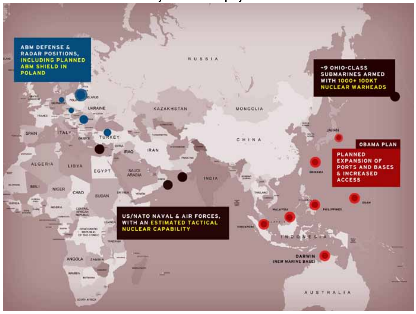
FIGURE 1 Encirclement of Russia and China by U.S./NATO Deployments

a chosen class of victims of the intended warfare to defend themselves from the intended preparations for launching such warfare in defense of its already threatened existence, is already a casus belli. Unfortunately, as I warned in an important public address during 2009, neither British puppet and Emperor Nero think-alike, Barack Obama, nor the fascist official Obama advisor Cass Sunstein, is truly civilized.