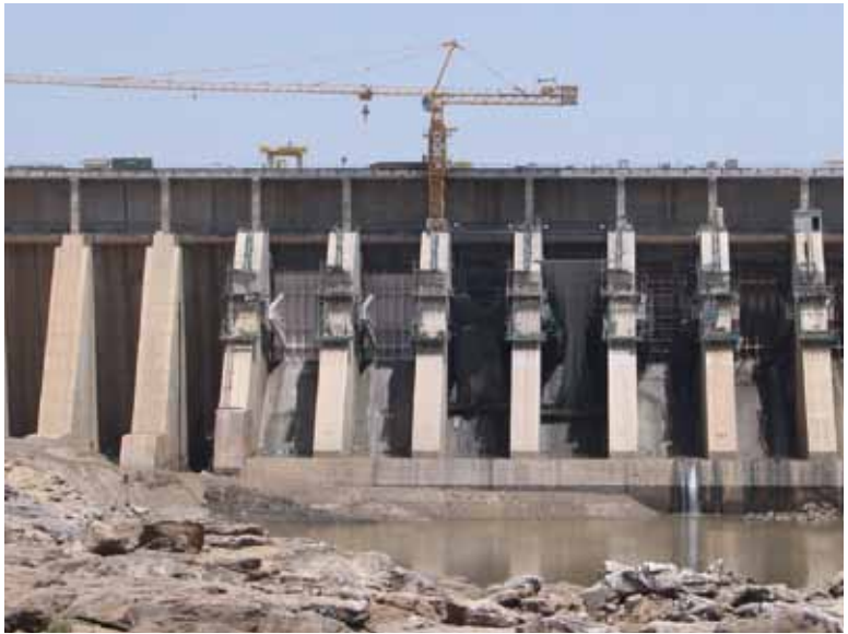
The Roseires Dam on the Blue Nile River.

Mutaz Musa told EIR that Sudan is utilizing about 10 billion cubic meters of water from the Nile, out of its allotment of 18.5 billion stipulated in the 1959 Nile Water Agreement with Egypt, which he insisted cannot