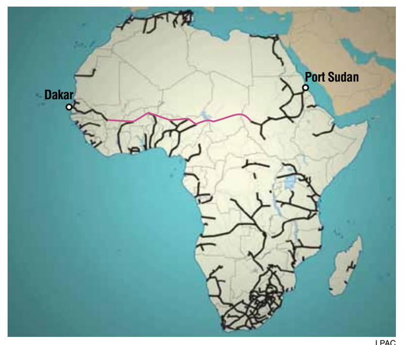
The Islamic Development Bank is financing construction of a long-overdue transcontinental railroad from Port Sudan to Dakar, Senegal. The existing railroads were built mainly by colonial powers, to ship extracted loot to the coasts. There has never been an east-west or north-south continental railroad in Africa.

Algeria, construction of this 14,000-km railway project across the girth of Africa will not just revolutionize trade and economic development for the nations immediately affected, but will have a major impact on whole continent.