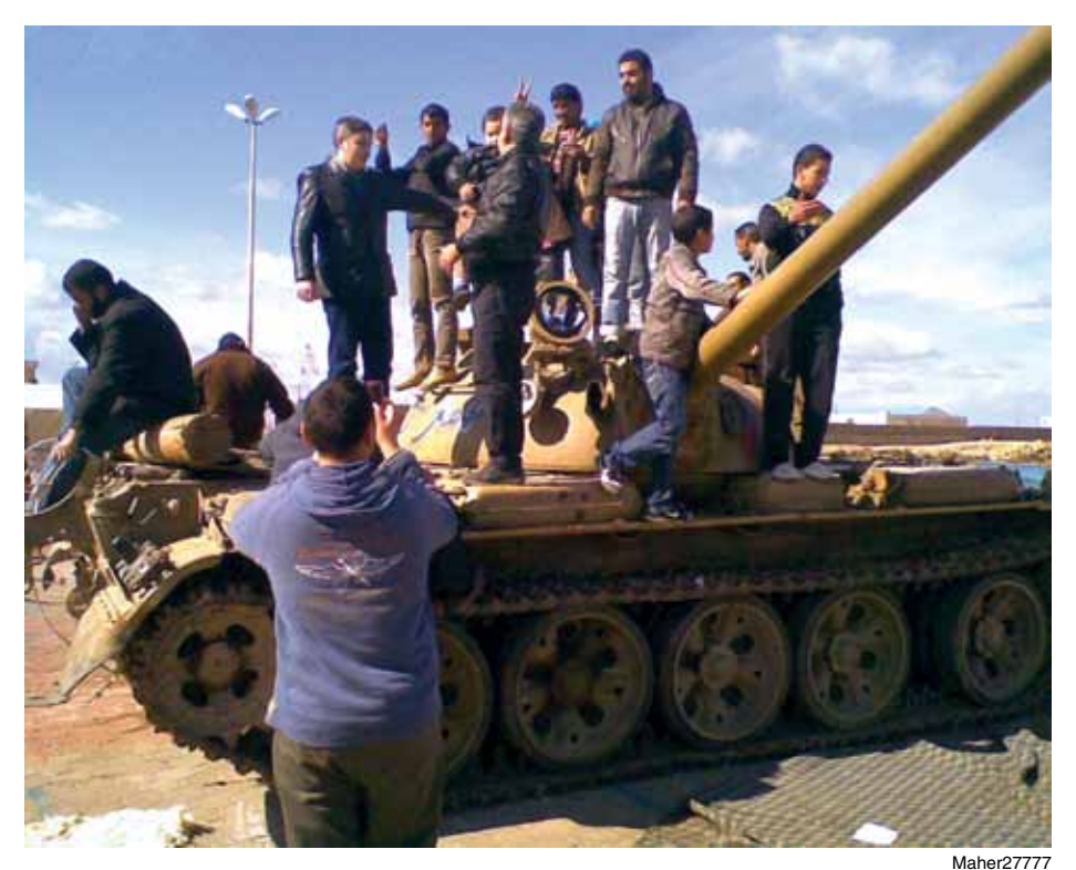
Obama's Libya War, fought under the rubic of R2P ("Right to Protect"), was orchestrated by the London-Wall Street financial empire, in its drive to end national sovereignty worldwide. Here, "rebels" climb on a tank in Benghazi.

while constant pressure will be put on the government by Islamic jihadists, who have been the only organized force on the ground. Their presence created the perception of a spontaneous revolt, which was organized by NATO special forces, operating with NATO intelligence.