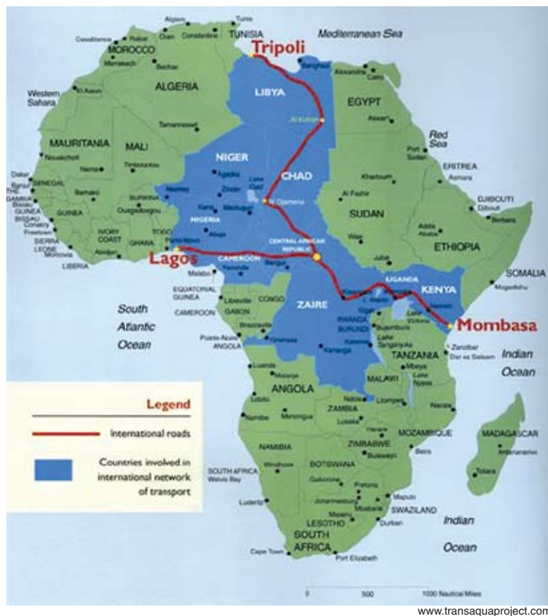
FIGURE 2 International Network of Transport

able implementation of the project, new technologies could also be of great help in this phase, compared to 30 years ago, when it was judged that the timespan necessary to implement the project was one generation. Today, this would probably not change much, but the costs would change, being limited by the use of modern and future mechanical equipment.