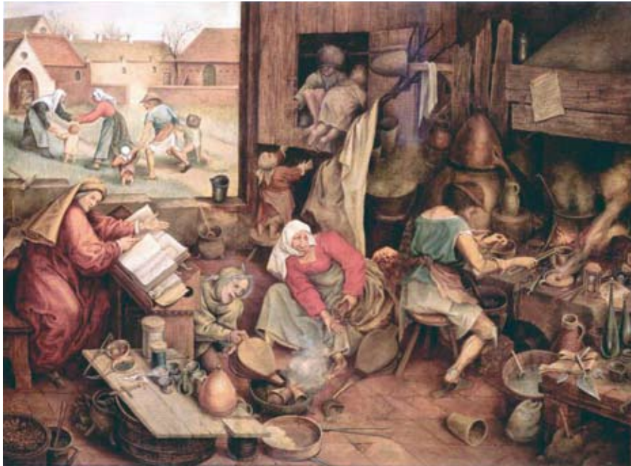
The magician confounds his intended victim by convincing him that what his sense perceptions tell him, no matter how outlandish, is real. Shown: "The Alchemist" (1558), by Peter Bruegel the Elder.

LaRouche's Four Power proposal, by convincing these countries that the United States and its dollar are going down to destruction, and that Britain's euro system shall prevail, with support from the Brazil carry trade. As LaRouche noted in remarks on Feb. 16: