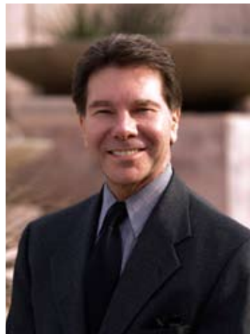
Would you buy a used car from this man? Robert Cialdini considers himself a master of "persuasion."

Cialdini's path to eminence began when he took leave from Arizona State University and went undercover, to apply for jobs and training in used car dealerships, fundraising organizations, telemarketing firms, and the like. After no less than three years of this, Cialdini surfaced once more in academia, claiming to have achieved