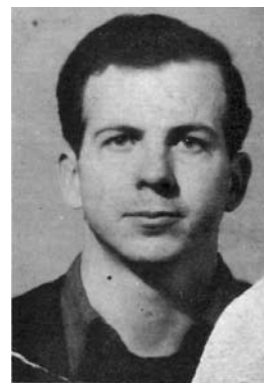
Lee Harvey Oswald