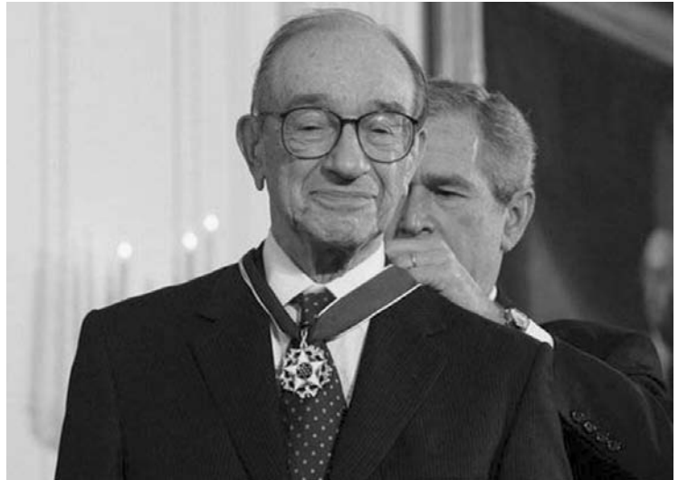
White House/Shealah Craighead

Now, what you do under this case, and with agreement with the United States, and its Constitution, with Russia, China, and India, it can be done. What you do, is you say, we put all the claims which are equivalent of monetary or credit claims in two piles. One pile we call "monetary." That's the manure pile. The other we call the "credit" pile. Now under the U.S. Constitution, money, when the Constitution is followed, is created only by the will of the government. It is done by the Executive branch of government, with the consent of the House of Representatives, and things flow from that. This credit being issued, is also authorized for monetization: So, the credit can be issued as loans for projects, or international loans, and part of it can actually be monetized, under the condition under which it was uttered. Particularly, if we had a national banking system, which we don't have presently, we could convert the Federal Reserve System, which is bankrupt, into a national banking system, as Hamilton proposed. Then it would do that, automatically. We do need a na-