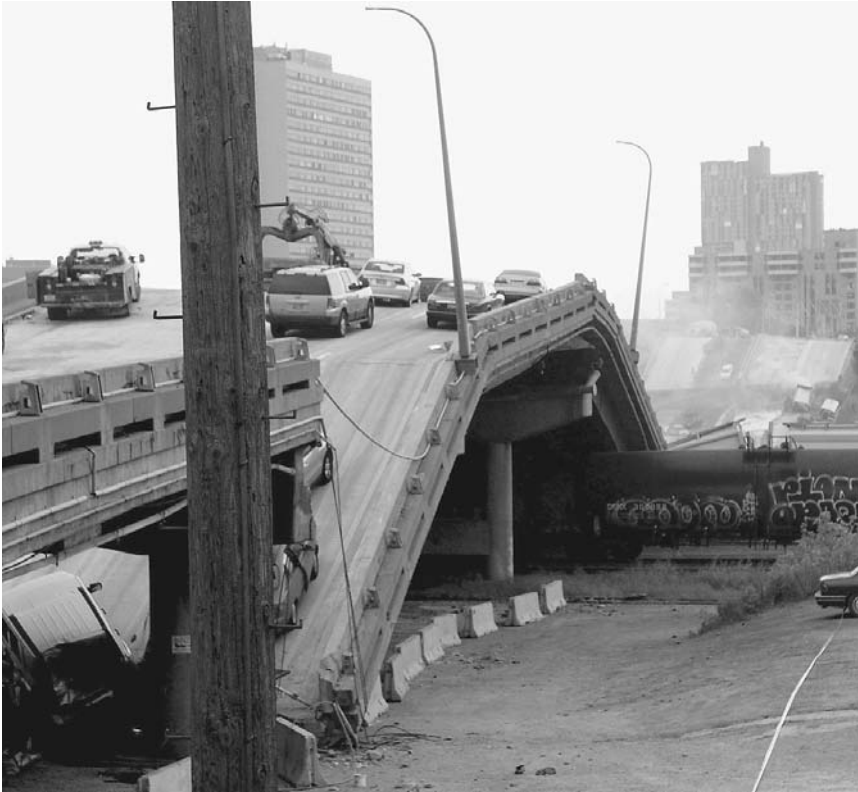
The nation's infrastructure is crumbling, and the Federal government is doing little or nothing about it, leaving the way for Bloomberg's corporatist "solutions." Here: I-35 at Minneapolis in 2007.

only through the constant pursuit of wisdom that an individual can become wise. However, wisdom requires work to attain, and so, at first glance, it is always less attractive to the uneducated mind. Therefore, we would seem to encounter the paradox that, in order for an individual to become wise—to enjoy the pursuit of wisdom—he would have to already be wise to begin with.