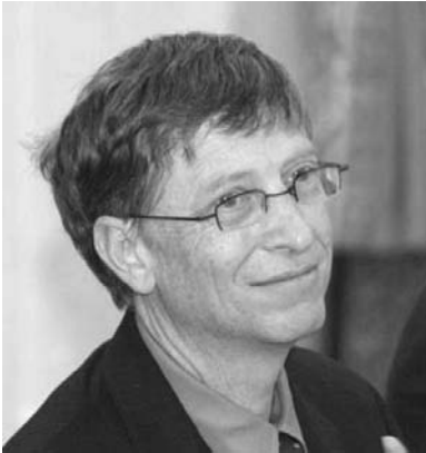
The presidents of today's digital "Suicide Clubs": Bill Gates KBE (left) and Sir Rupert Murdoch.