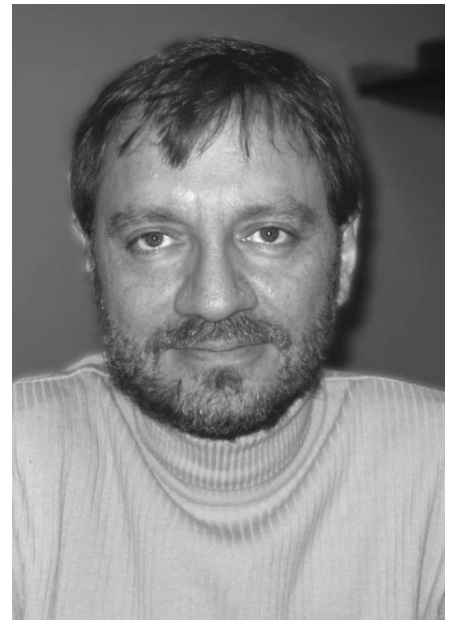
University of Utah

Lyndon H. LaRouche, Jr.: "If the U.S. dollar collapses, you will have a global, chain-reaction collapse of every economy of the world, beginning within a few months."