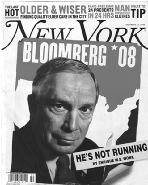
A Bloomberg government in the United States would be very much like Mussolini's Fascist government of Italy in the 1920s.