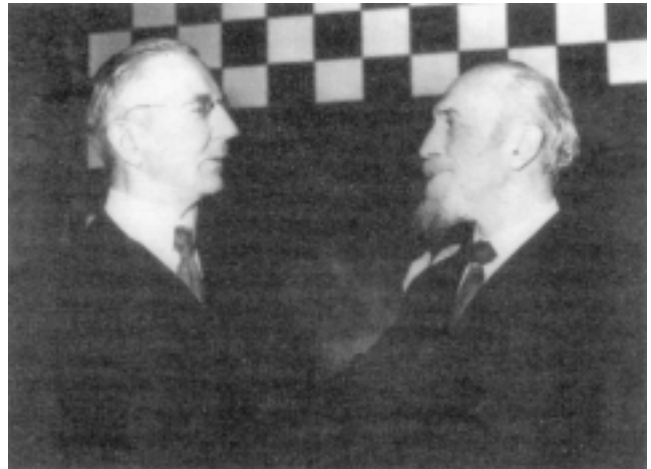
Bank of England Gov. Montagu Norman (right) with Reichsbank President Hjalmar Schacht. Norman, a former partner of Brown Brothers, was the most avid of Hitler's supporters within British ruling circles; Schacht, who became Hitler's Economics Minister, was Norman's protégé.

that we have drawn our line and should hew to it." 10