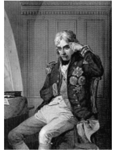
Adm. Horatio Nelson, who beat Napoleon at the Battle of Trafalgar, advancing Britain's geopolitical control of the continent.

the nations of the continent, as the earlier Seven Years' War had paved the way for the establishment of the British East India Company as an empire at the fateful February 1763 Treaty of Paris. Some people, still today, curiously, regard Napoleon as a hero of modern France. 14 I would prefer Jeanne d'Arc, Louis XI, Cardinal Mazarin, Jean Baptiste Colbert, Lazare Carnot, and Charles de Gaulle, and also, in a certain important sense, the lovely historical irony of the Richmond who followed Louis XI in more than one respect, as England's Henry VII.