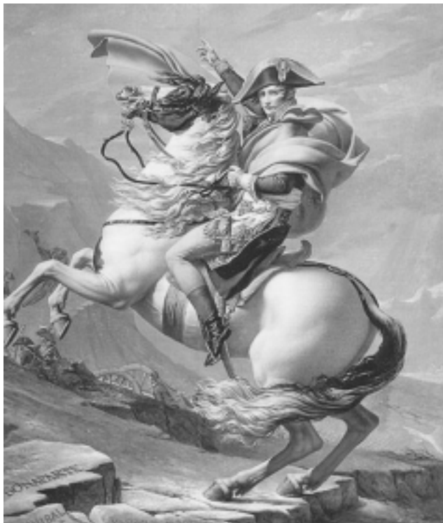
Although some people, still today, consider Napoleon Bonaparte as a hero of modern France, he was in fact a creation of the Martinists and Robespierre—and the predecessor of Adolf Hitler. Here, "Napoleon Crossing the Alps," by Jacques-Louis David.

The British assets associated with the anti-Leibniz circles of Shelburne's operations in France, included not only the