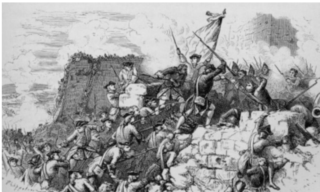
During the Seven Years' War (1756-1763), the Anglo-Dutch Liberals battled to control the nations of continental Europe, and to maintain colonial rule in North America. The war concluded with the Treaty of Paris in February 1763.

Since the Anglo-Dutch Liberals' imperial triumph in the Seven Years' War, new wars based on that model had been the continuing chief source of the repeated ruin of the continent of Europe, and of Eurasia. It was this British policy and its