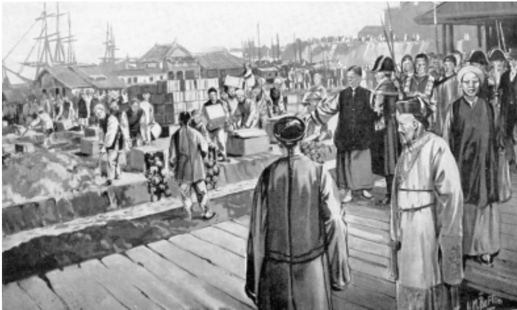
The British Empire was initially established as an empire of the British East India Company, which looted China by means of the opium trade. Here, Chinese authorities are shown fighting back by destroying an opium crop. Britain responded to such insubordination by waging the Opium War of 1839-1842.

practice, rooted in the model of the Seven Years' War, which had been the original source of the recurring mortal conflict between the future U.S.A. and the British Empire.