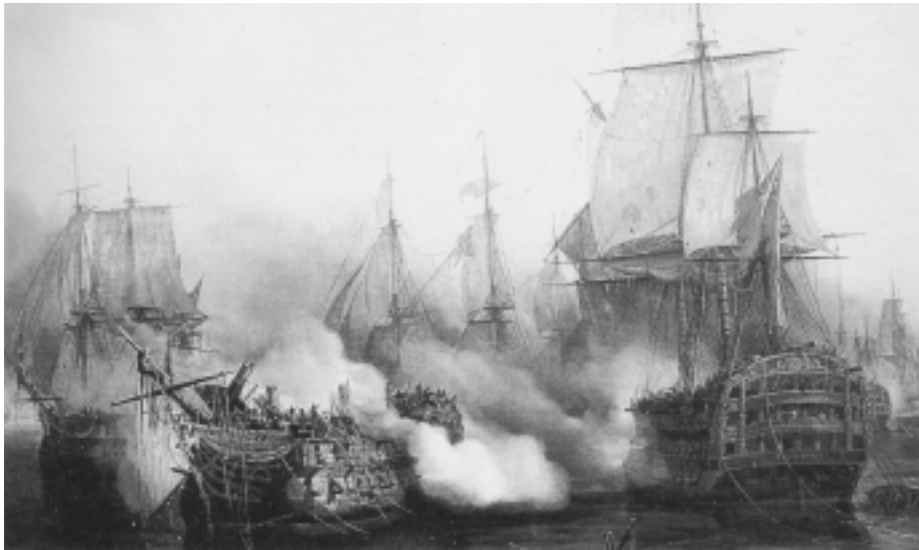
The Battle of Trafalgar, Oct. 21, 1805. Once Britain's Admiral Nelson had won the crucial battle there, Napoleon was bottled up within continental Europe, where his role was to bleed France itself almost to death, while destroying the other nations of the continent.