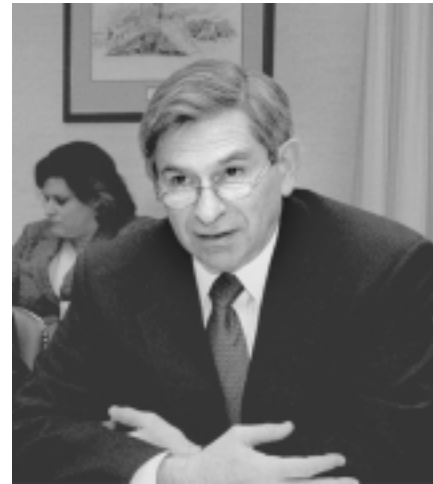
Left to right: Anwar Ibrahim, George Soros, and Paul Wolfowitz. Anwar wrote in his 1996 book, about the legacy of colonialism, “When they hector us on issues such as human rights, patronize us on the matter of values, impose conditionalities on trade, we cannot help but suspect a hidden agenda—a new form of domination in place of the old.” Yet today, he has joined the “hecturers,” and counts Soros and Wolfowitz as close friends.

However, I wrote, there was “a serious flaw in the assumptions underlying Anwar’s analysis, a flaw which could lead to severe and deadly consequences in the global financial and social crisis we are now confronting. Stated summarily: In attacking the ideas of the Enlightenment, Anwar has . . . adopted the fundamental, flawed axiom of the Enlightenment itself, as introduced into Europe by the Venetian enemies of the Renaissance—that is, that there exists an unbridgeable gap between reason and faith, between science and religion. While Anwar decries the practitioners of the Enlightenment for exalting reason over religion, he accepts the underlying assumption that man must choose between these supposedly irreconcilable worldviews. In fact, perhaps the most profound contribution of the Renaissance was to make manifest mankind’s unique position in the Creation, that of being in the image of the living God, by virtue of the divine spark of reason , and thus [mankind] is capable of discovering and mastering the laws of nature, participating in the continuing creation of the universe.”