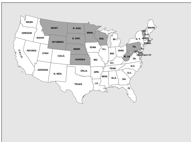
FIGURE 1.1 1969: 14 States Had Federal Legislated Minimum Hospital Beds Per 1,000