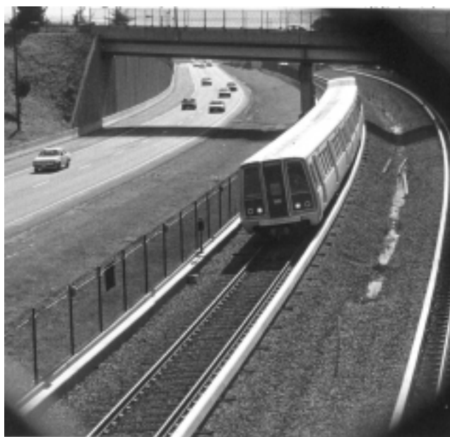
Mass-transportation by rail, as shown in this picture of the Dulles rail corridor outside Washington, D.C., exemplifies the second class of infrastructural improvements which man creates.

As I have often emphasized in other published locations, a mere mathematician can observe the movement of the planet; only a mind like Kepler's could recognize the power which moves that planet. The essential importance of the role of, and care for the individual member of society, lies in that which motivates the individual's distinctly human powers to act in ways which are to the benefit of his society. This power of motivation is therefore an essential feature of the proper role of health care and sanitation within society's basic economic infrastructure.