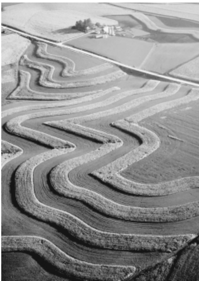
Alternating strips of alfalfa with corn on the contour, to protect this crop field in Iowa from soil erosion, is a means by which man helps nature do better than it could have without man's intervention.

society to that individual and family which is threatened by the prospect of avoidable death or simply serious illness. The standard for putting an animal out of its misery, if applied to human beings, puts the human target of that ideological standard of practice into the same category as a mere animal, and also imposes a loss of the sense of humanity in the persons who do that targeting of their fellow human being. Both the victim, and the persecutor are dehumanized. Our society, our nation, has been dehumanized over the recent two generations in that manner and degree which the malthusian ideology of the "living will" expresses.