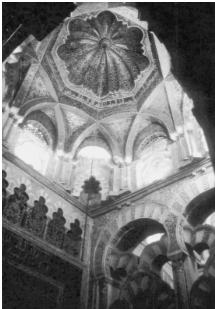
Shown here is the dome of the Great Mosque of Cordoba, which was built in A.D. 786-787. This is just one example of the architectural jewels left by the Islamic presence in Spain.

relative strengthening of Jewish communal life, and even a strange sense of being less “in the line of fire,” seeing the Conversos taking the brunt of anti-Jewish sentiment. Suddenly all that was shattered, and most of the Jews could only seek to comprehend such a sudden cataclysm in terms of God punishing his Chosen for sins and transgressions. Many Sephardic accounts compared the new Jewish suffering to that of the Prophets and patriarchs in Hebrew scripture. A mystical current in Sephardic Jewish thinking seized on the expulsion to claim it was God’s sign that it was time for an in-gathering of Jews in the land of Zion. Almost all were aware that the expulsion occurred just a day or so before the 9th of the month of Av in the Jewish calendar—the fateful day, according to tradition, in which both the first and second destructions of the Temple in Jerusalem had occurred.