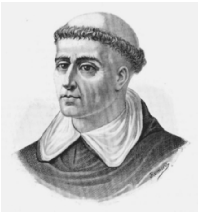
Torquemada became the Grand Inquisitor for the areas of Spain controlled by Fernando and Isabella in 1483, and stayed in office until his death in 1498. The institution he established lasted virtually intact for 330 years.

viduals raised to high office in civil and ecclesiastical administration. They started the circulation of a new currency valid for each of the respective kingdoms, where 156 different coinages had previously held sway, and began the process of unifying the two kingdoms into one state, a unification which would only reach completion in 1517. And they backed the explorations of Christopher Columbus, the extraordinary mariner trained in Portugal by circles collaborating with the key figures of the Council of Florence, and equipped with a map from Nicholas of Cusa's friend, the great Florentine astronomer and mathematician, Paolo dal Pozzo Toscanelli.