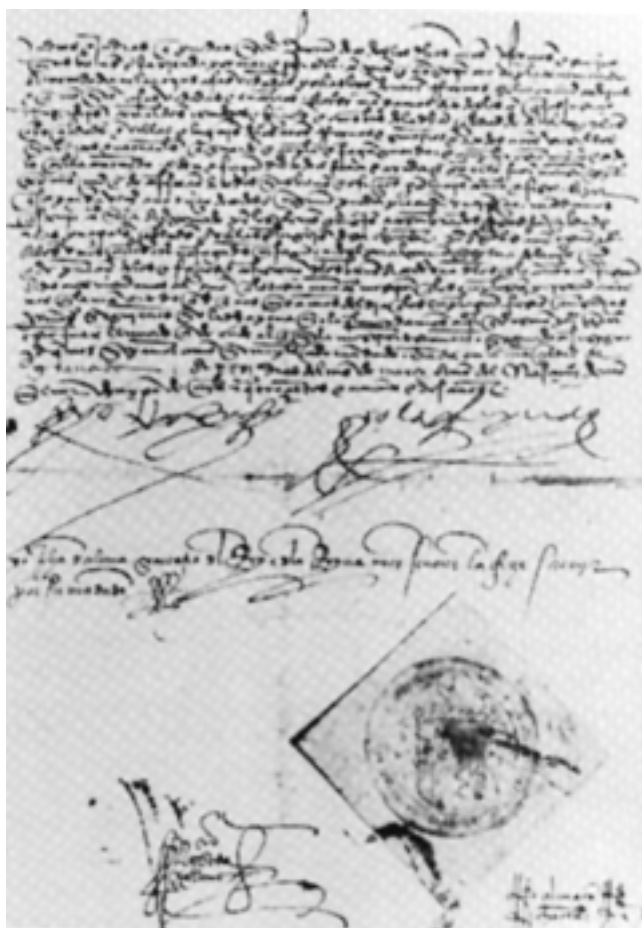
Shown here is a page of the original Edict of Expulsion signed by Ferdinand and Isabella on March 31, 1492.

de la Caballería, vice chancellor of Aragon, refused to recognize the authority of the Inquisition and Torquemada. He succeeded in having Pope Innocent VIII take the case out of Torquemada's hands. Torquemada refused; the Pope held firm; and in the end, after reviewing the court papers, the Pope absolved de la Caballería. In another notable case, Fernando himself intervened on behalf of his treasurer, Luis de Santangel. Contrary to Fernando's customary briding at Papal indulgences, in this case he sought Papal intervention on behalf of his court official himself. It saved Luis de Santangel's life, but Santangel had to suffer the disgrace of walking in a procession of penitents, clad in a sanbenito .