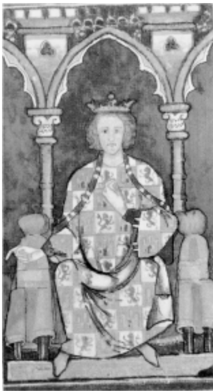
Alfonso X "The Wise," King of Castile, who ruled in the mid-13th century, presided over a renaissance of learning which involved Judaism, Christianity, and Islam. He was known as the "king of the three religions." His father's tombstone contained writing in Hebrew and Arabic, as well as Castilian and Latin.

ring, and seek recourse in a judge to decide, the judge at first declares that none of the three bitterly quarreling sons can have the true ring—none of them has the power to make himself beloved of the other two. The brothers naturally protest, at which point the judge extends his verdict: "Let each son vie with his two brothers to bring to light the promised virtue of the ring he wears upon his finger! Let each son always nourish this great virtue to shine forth through gentleness, a loving spirit, deeds of kindness, and a most fervent piety and devotion to his God! Then, in days to come, when the magic powers contained within these rings, worn by your children's children, will brighten up the world, I'll call you once again before this seat of judgment, after a thousand thousand years have passed. On that day a wiser man will sit upon it and hand down his decision. And now, depart!"