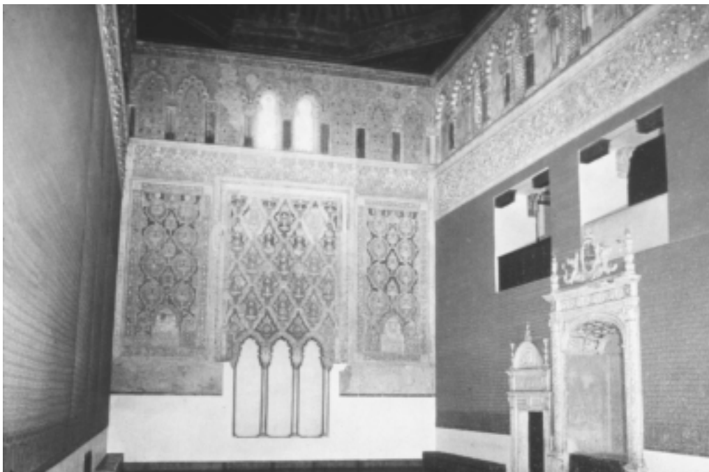
This Synagogue of the Transition, built in Toledo in the mid-14th century, reflects the highly developed and well-established position of Judaism in the Spain of the Convivencia, the “living-together” of the three major Western religions.

ing of a reactionary Synarchist tyrant like Napoleon or Hitler.”