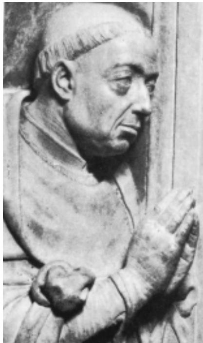
Cardinal Nicholas of Cusa, shown here, represented the antithesis of the Inquisition approach, as he showed by responding to the capture of Constantinople by the Muslims by writing the “Peace of Faith.”