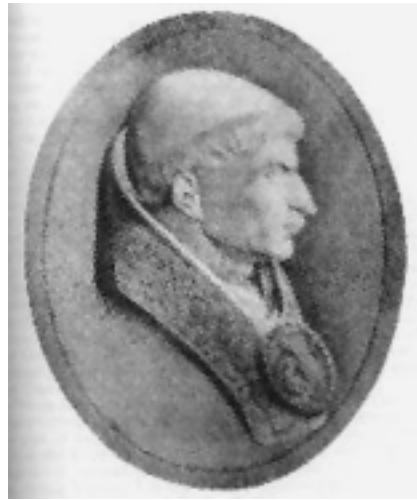
Cardinal Francisco Ximenez de Cisneros was a prime mover against Spain's Muslims in the late 15th century, although, paradoxically, he was also a promoter of Renaissance ideas.

Even in his last year, he was laboring on the third revision of his Instrucciones , the bible of Inquisitorial practice which he had first compiled in 1483. When he died, he left behind an institution that would function with very little change in procedure for another 330 years. Although it never exerted as dramatic an overall influence, nor took as many lives in a short period as it did under Torquemada, and although its targetted victim populations shifted from Conversos to Lutherans and Erasmians, then to the converted Moslem population ( Moriscos ), then back to a second wave of Portuguese Conversos at the turn of the 17th Century, its fundamental character was firmly set. Henry Charles Lea, dean of the historians of the Inquisition, noted the reports of Venetian envoys in the early 16th Century, "who lauded its [the Inquisition's] services in the suppression of heresy, and to whom, as practical statesmen, it was an object of wonder and admiration, as a machine perfectly devised to keep the people in abject subjection. . . . The envoys were profoundly impressed by the