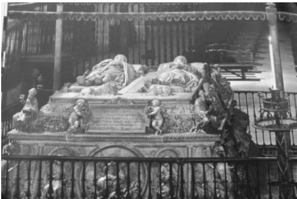
Queen Isabella and King Fernando are buried in Granada, Spain.

of all: the entire novel, Cervantes tells us, was written by one Cide Hamete Benengeli—in Arabic!