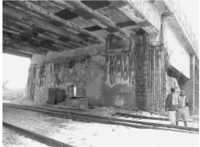
The aging Rockefeller Road Bridge, Cleveland, Ohio, is one of many decaying bridges over the rail corridor.