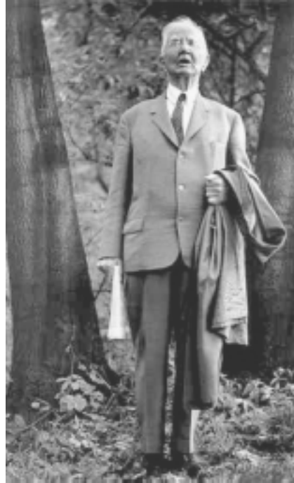
Former Nazi Economics Minister Hjalmar Schacht, in 1962. He was let off scot-free at the Nuremberg war crimes tribunals, because his economic policies, which paved the way for the gas chambers, were (and are) shared by many "liberal" financial circles outside Germany.

Shultz got his PhD in economics, specializing in Lewinite labor-management relations, later joining the MIT faculty. During the Eisenhower Administration, Shultz was brought to Washington, to work for Arthur Burns at the Council of Economic Advisors (Burns's other leading protégé was Milton Friedman). Shultz next moved to the University of Chicago Economics Department, joining Friedman. Shultz became the dean of the University of Chicago Graduate School of Business in 1962. The Chicago School was the American command post for the financier oligarchy's Mont Pelerin Society, the most radical anti-government, free-trade