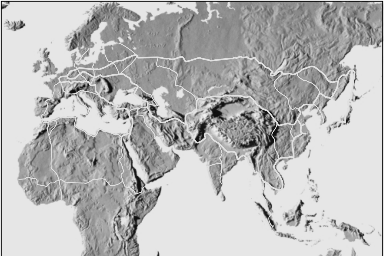
The future cooperation of Eurasian nations in building “land-bridges” of modern transport and infrastructure, including across Africa, is the marker of what is called, in Vernadsky’s work, the action of the noösphere.

within the self-imposed bounds of what they suspect they are permitted to think by their Anglo-American overlords. Their hearts may be in the right place, but they keep their fists in their pockets.