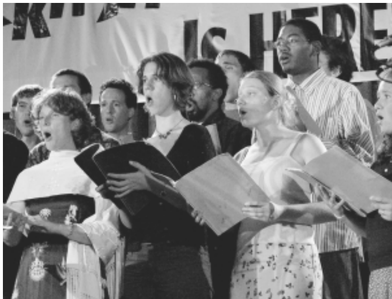
The LaRouche Youth Movement chorus sings Bach's motet "Jesu, meine Freude." LaRouche chose this advanced choral work, along with Gauss's Fundamental Theorem of Algebra, as the foundations of intellectual work for his youth movement.

So, what we need to do, is start from the top down, not from political authority, and scientists begging at the doors of political authority. We have to have movements, which are based upon movements of ideas among people. Especially young generations, upcoming. As they come into about the age of 18, where they pass over from adolescence to young adulthood, is the time of the richest development of the future