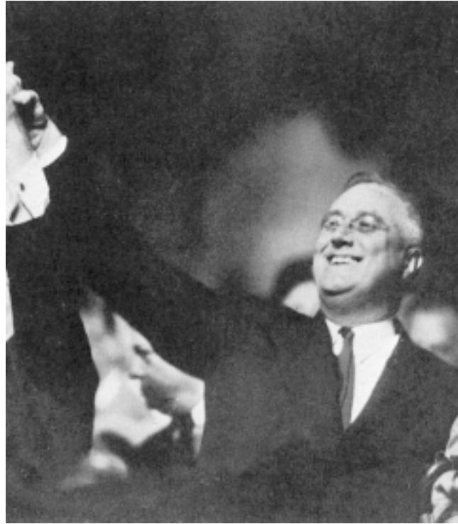
Franklin D. Roosevelt: "He didn't change anything in the Constitution, he upheld the Constitution."

On the other ones—let's take them in reverse: Don't believe in the free market. I know about the free market. First of all, and what we have to do in this, as in some of the cases that were raised by our friend from France, we get away—when we start to talk about economics, I've talked about things that assume economics, we tend to wander to insanity, because the current ideas about economics in the world, are