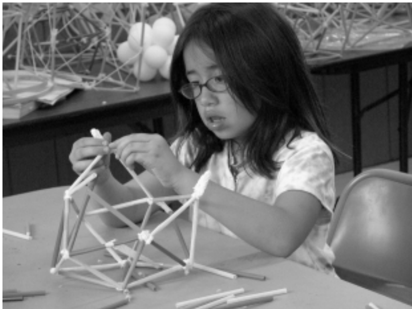
The Greek study of "spherics" had its origins in astronomical investigation, and led to the development of constructive geometry—not the fixed axioms of Euclid. The LaRouche Youth Movement has made this the core of its scientific pedagogy. Here, a youngster constructs the Platonic solids at the Schiller Institute Summer Camp in Leesburg, Virginia, July 2004.

So, these are the kinds of experiences which give mankind a sense of what kind of a universe we're living in: Mankind, looking to the stars, sees us, on this planet, in the universe. And the way we see what we see, when we look at the stars, or the movement of the planets, we see a universe in motion; with certain things which are relatively fixed, periodically fixed motions, and some things that are a little bit more irregular. And from studying the problems of both the combined fixed motions and irregular motions, and the coincidence of these changes in motions upon the conditions of life inside places such as Egypt, such as the setting of the times of the Nile—crucial turns in the Nile, were associated with certain astronomical positions of certain stars—they developed a concept of spherics, in which they made no Cartesian assumptions, no Euclidean assumptions! The universe we're living in, is a giant spheroid, and we're observing spheroid-like motions, within this area. This, then, becomes the notion of universality : a kind of universality which you know, not because you assume it's true, but because it's demonstrably true, as in the case of these astronomical observations. And therefore, you say, "What determines our life in this universe , this universality, are those things which can be expressed within assuming that the action's occurring in a form, which is charac-