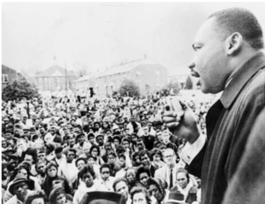
Dr. Martin Luther King, Jr. addresses supporters after the Bloody Sunday march in Selma, Alabama, March 7, 1965. King was not a “practical” man, but a great man. On the night before he was assassinated, he profoundly expressed his conception of his own mission and his immortality: “I’ve been to the mountaintop.”

And our identity, our sense of what our function is, as a living person , is to take ourselves out of this childish state, of