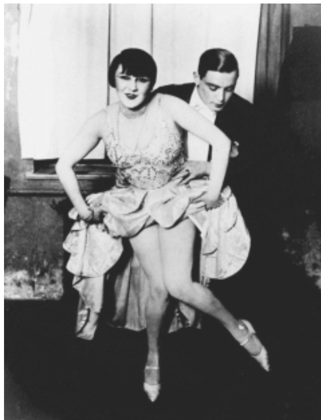
The corrupt “Charleston generation” of the 1920s had their degenerate fantasy-world blown apart by the Crash of 1929-33, under President Hoover.

And, the way the culture is presented, the corruption is presented, it's presented in the form of money. The characteristic of the Baby-Boomer generation, in particular, unlike the