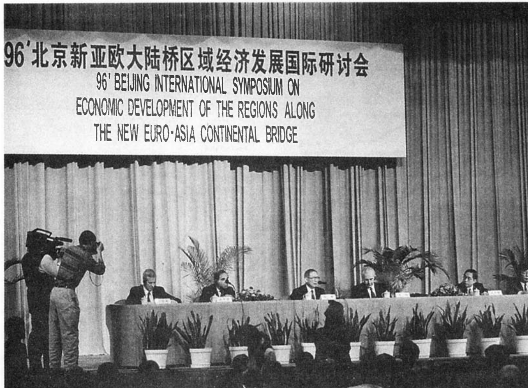
The genie is out of the bottle: The convergence between Lyndon LaRouche's policies, and the Beijing government's drive for a "New Silk Road" development program, caused great consternation among British representatives at the Beijing symposium on the New Euro-Asia Continental Bridge.

lurches at the brink of total disintegration, the fateful choice between only two, alternative policy courses, confronts the world's nations with ever greater urgency: Either there will emerge a cooperation among leading powers, to carry out a bankruptcy reorganization of the world monetary and financial system, and rebuild the world economy on the basis of large-scale infrastructure projects; or the collapse of the financial system, under conditions of Nazi-like austerity, will plunge humanity into a genocidal "Dark Age," during which the human population would be reduced from its present nearly 6 billion, to 100 million or less.