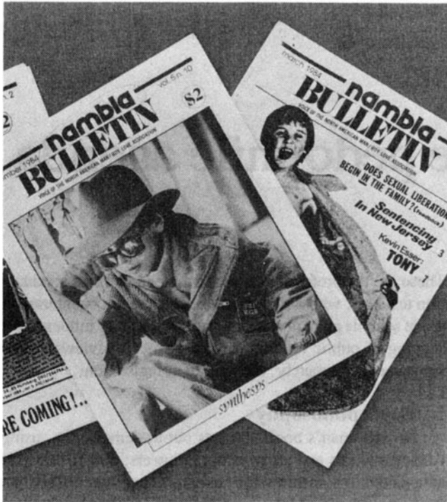
Child sex propoganda from the North American Man/Boy Love Association: no longer just on the lunatic fringe.