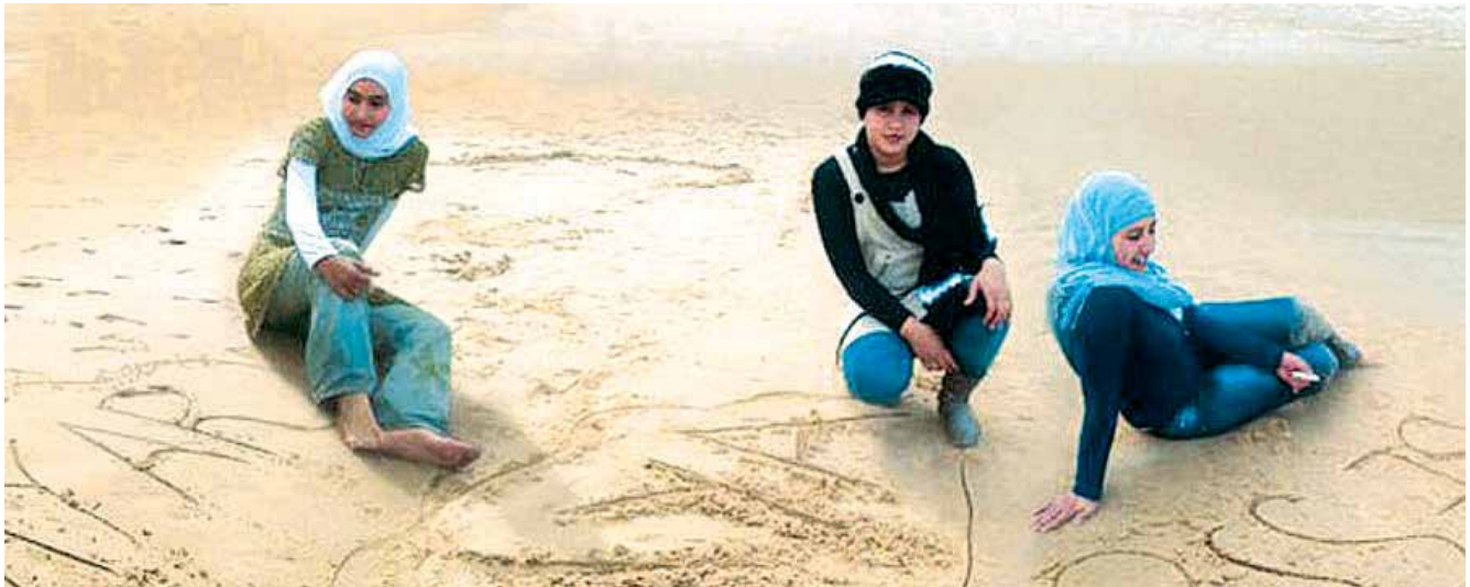
Daughters For Life Foundation

Dr. Abuelaish: My daughters—it's happening now, for the Palestinians in the Gaza Strip. The same as in 2009, the [Israeli army's] Cast Lead Operation. I don't accept calling it as an "operation," because we use the medical term for surgical operation to heal and to help the patients; not to kill, or destroy, or damage. Operations, ethically and morally in medicine, must be to improve and heal the wounds of the people; not to damage