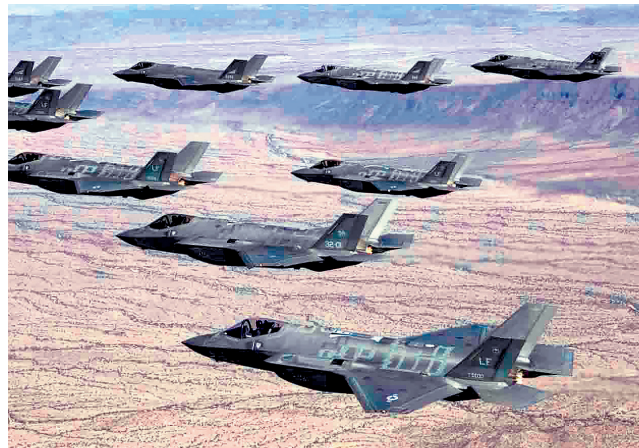
Luke Air Force Base Courtesy Photo

Number four is Boeing . They make Apache attack helicopters, and the F-15 fighter jets which are being heavily used in Gaza and elsewhere. Five is General