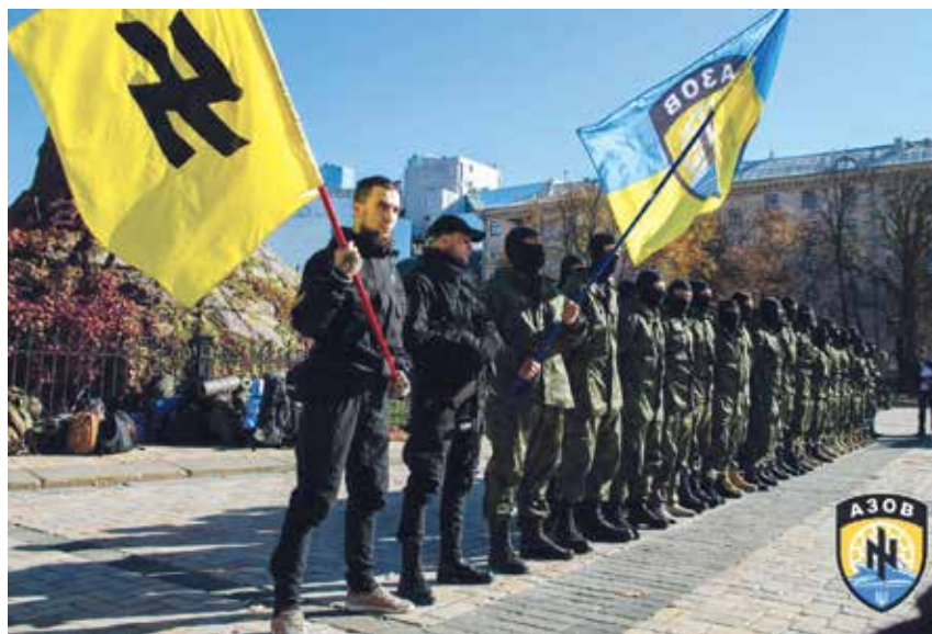
Azov’s Vkontakte page

Here is a real-life Orwellian “Ministry of Truth.” The Center for Countering Disinformation holds up the hideous neo-Nazi Azov Regiment as “the symbol of the Ukrainian struggle” to unify Ukrainian society around