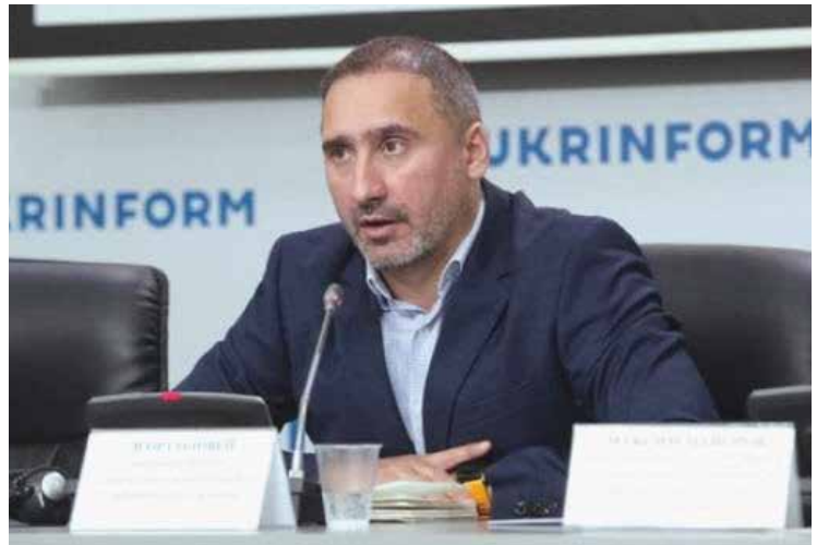
Ukrinform Institute of Mass Information

The signing of the “milestone” NATO-Ukraine Strategic Communication Partnership Roadmap in September 2015 situated NATO to advise Ukraine’s government to “plac[e] strategic communications at the