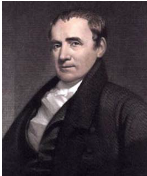
Henry Carey was the 19th Century's leading proponent of the American System of economics, against the Adam Smith school of monetarism and free trade.

Henry C. Carey (1793-1879), President Abraham Lincoln's chief economic advisor, promoted the American industrial model around the world. The work excerpted here, is from The Slave Trade, Domestic and Foreign: Why It Exists and How It Can Be Extinguished, Chapter XIII, "How Slavery Grows in Ireland and Scotland" (1853). Some punctuation and paragraphing have been added; all emphasis in original. (For the complete work, see http://www.gutenberg.org/ebooks/8000 ).