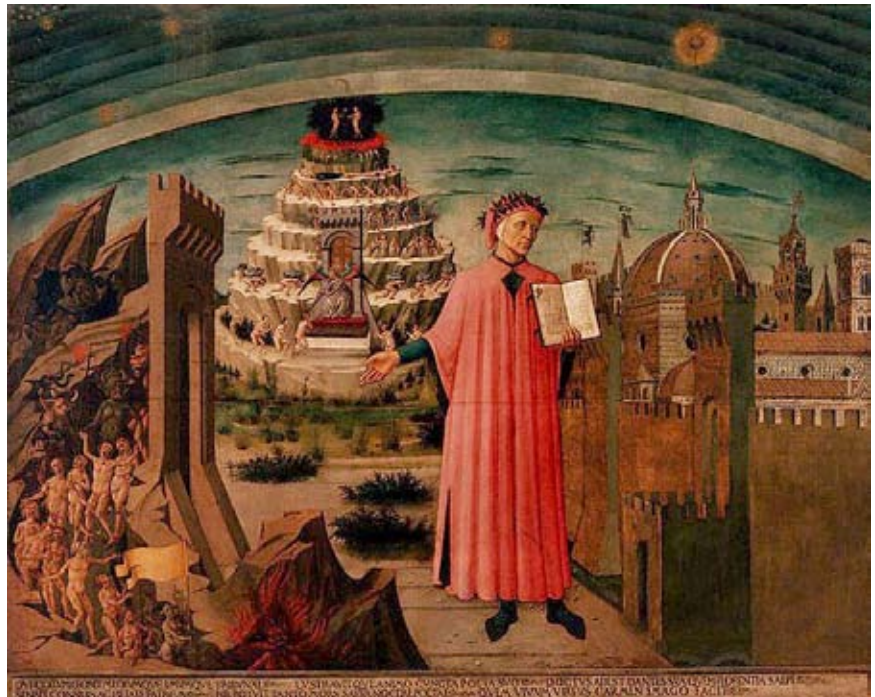
Dante Alighieri's epic poem, the Commedia (Divine Comedy, 1308-21) created the beautiful Italian language, while his De Monarchia (1312-13) established the foundations for the modern nation-state. Dante is portrayed in this painting by Domenico di Michelino (1465), with his poem: Hell, Purgatory, and Paradise are shown, with Brunelleschi's dome on the Cathedral of Florence, depicted, anachronistically, on the right.

hannes Brahms, the wildly Romantic admirer of the fervently Satanic Richard Wagner and Franz Liszt, the Hugo Wolf of his Mörike and Goethe Lieder.