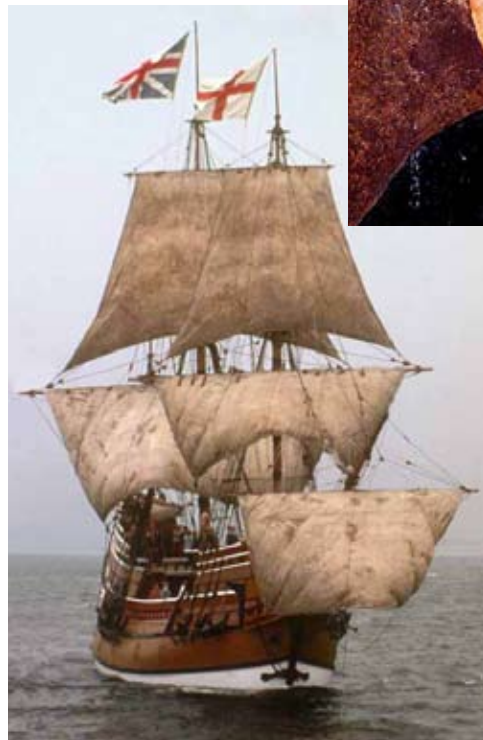
A dynamic process was set in motion with Cusa’s design for the creation of a new civilization across the oceans, far from the reach of the European oligarchy; hence, the voyages of Columbus (above); and the later Mayflower (left) settlement in the New World. (Cusa is depicted in this relief, (top) to the left of St. Peter.)

future outcome of those discoveries, that for the benefit of future generations of mankind; such is the option we should seek in the normal choice, a choice of that which we have chosen to become currently engaged in building, in our devotion to the future defined in this way. “What, child, do you intend to become when you are