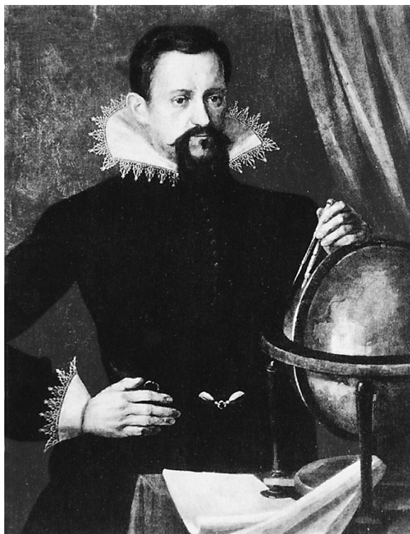
Johannes Kepler (portrait from the University of Strasbourg, 1727).

Thus, mapping of what were, at least, apparently two fixed points on the ground-level map of our planet under the condition of changes in the apparent positions of planets and stars over time, as shown by the work of the great Eratosthenes, defines that irony which gave rise to humanity’s notion of universal during those times. This, of course, leads to the apposite approach, locating the changes in the map of the planet’s surface according to changes observed to occur within an astronomical universe, and, then, in turn, to the study of detected, long-ranging changes in what might have been thought a simple regularity of movements in the heavens. It is important to acquire the habit of thinking about related matters in such a fashion, even if