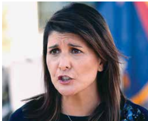
Former UN Ambassador Nikki Haley is now a Republican war hawk presidential candidate.

Among those involved are Elliot Abrams, a former Deputy National Security Adviser and co-founder of PNAC, Doug Feith and Lewis “Scooter” Libby, both instrumental as aides to former Vice President Dick Cheney in launching the Iraq war. Other institutions include the Foundation for the Defense of Democracy, and United Against Nuclear Iran (UANI), which includes former government officials and neocon hatchet men. Former Democratic Party nominee for Vice President and current U.S. Senator Joe Lieberman, a close ally of