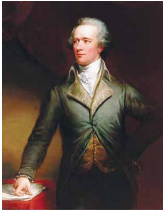
Only by shifting to a U.S.-based credit system, as established by our first Treasury Secretary Alexander Hamilton, and away from a monetary system, will it be possible to rescue the world's population from the onrushing New Dark Age. This portrait of Hamilton was painted by Daniel Huntington (1865).

Our system, from the beginning, was therefore a credit system, as our Constitution provides. You can not print money, as such. You can utter money, you can utter credit, by a vote of the Congress, and the President. But what you can do, and how far you can go, is limited by this vote, by this action. So, we create