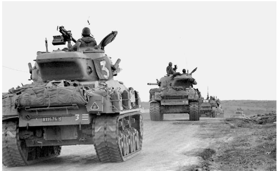
The so-called “Arab-Israeli” or “Arab-Jewish” conflict, is, in fact, one which has been played, from the outside, in our time, by the British Empire, whose intention is to control the vast oil resources of the region. Shown here: Israeli tanks advance in the Golan Heights, during the “Six-Day War,” June 1967.

This conflict arose long after the period of about 17,000 B.C., when the last great glaciation, of about 100,000 years ago—these glaciations are never quite simple, but they do have demarcations—and we’re coming to the end of a warming period. As a matter of fact, we’re already, contrary to some rumors, we’re in