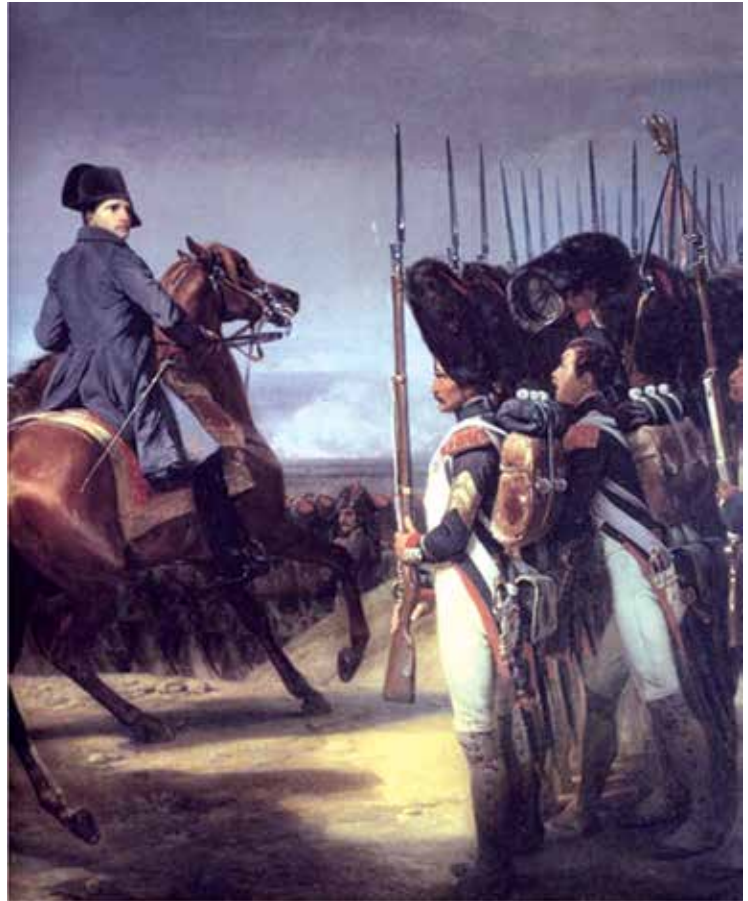
The Emperor Napoleon, shown here in a detail from "The Battle of Jena," by Horace Vernet, was a tool of the British Empire. His Seven Years War ruined Europe, allowing Britain to emerge triumphant in 1815, until the U.S.A., after 1876, checked its power.

Then you had Reagan, who was a complex creature, with some good instincts. He belonged to my generation, an older version of it, and was very strong under Roosevelt, but, as we saw immediately, he adapted to the Truman Administration very quickly, and that was his problem. I had some dealings with him which were very important, and could have changed history for the better—and they did change history—but we could have