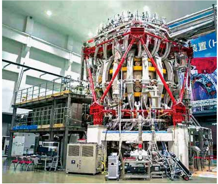
The technologies now emerging to dominate the future are branches of the same unified scientific conception. One such branch is man-controlled plasmas of very high energy-density. Shown: the HL-2M Tokamak fusion reactor in Chengdu, Sichuan Province, China.