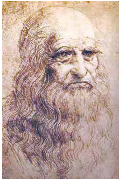
Possible self-portrait in 1513.

Kepler explicitly based all of his contributions to physics on this discovery of Leonardo's, as Kepler understood this discovery from the standpoint of Cusa's