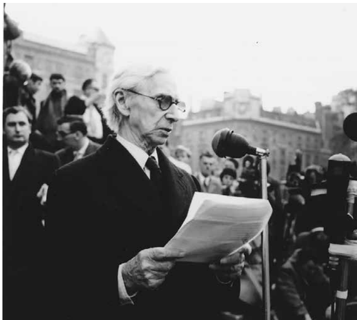
Niels Bohr Library

Stalin saw through the tricks of Russell and Russell's lispig crony, Winston Churchill, and rejected