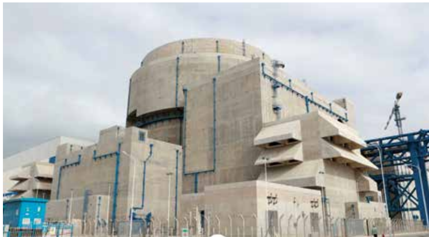
China National Nuclear Corp.

With breeder reactors, no one knows if this will be cheap enough to standardize, and be the breakthrough technology; or perhaps it will be the