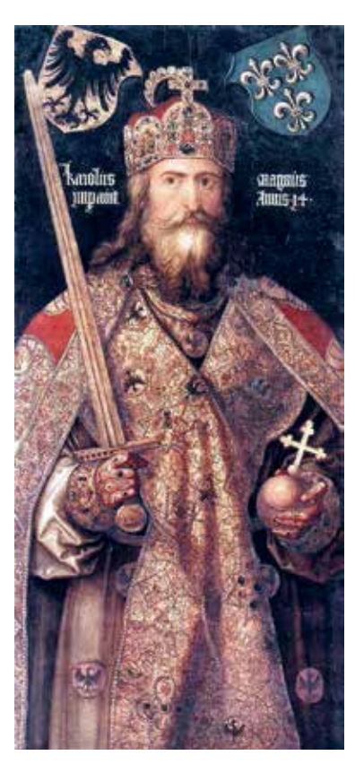
The development of the American economy was based on the systems of integrated rivers and canals under Charlemagne, which provided the model for the development of the territory of North America under the same methods. This portrait of Charlemagne is by Albrecht Dürer (c. 1512).

Such are the essentials of an introduction to those underlying principles of a modern practice of physical science on which any competent expression of economic science depends.