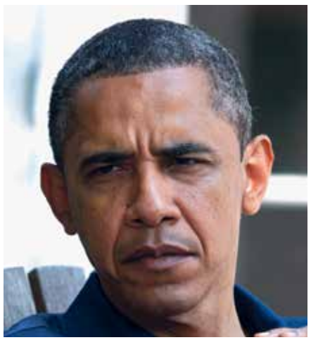
President Obama is a remarkably exact image of the character and expressed practices of the Roman Emperor Nero, as defined by LaRouche, in his April 11, 2009 webcast.

been a product of either the "infectious disease-like" practice of warfare, or the necessary resistance to the oligarchical evil's extensive periods of reign upon relatively large regions of habitation. The practice of cannibalism, or its likeness, is the characteristic of a part of the human species whose policies and practices are no longer human.