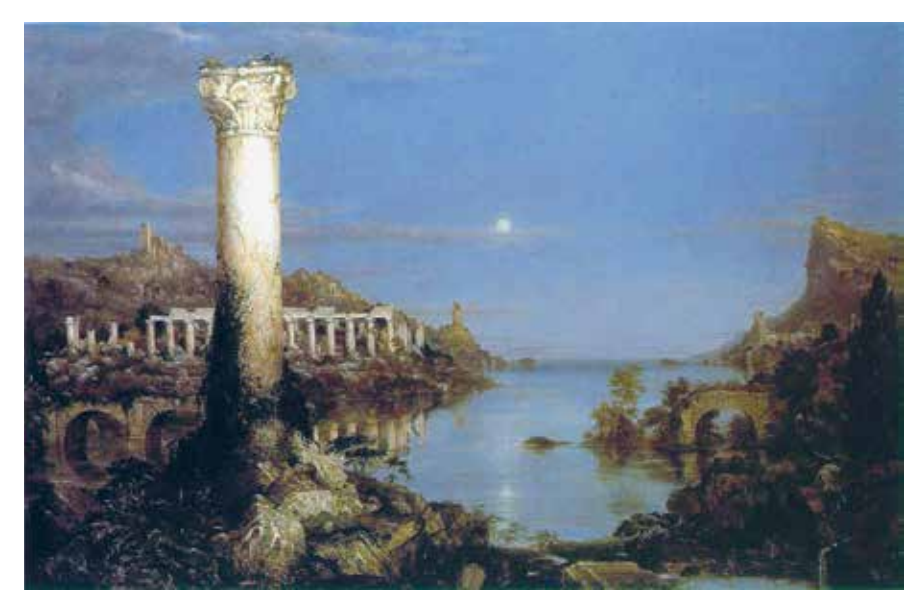
The Roman imperial forms of degenerate cultures, such that of the British monarchy of today, represent a type of oligarchical decadence, historically found in such empires as the Babylonian, Persian, Byzantine, and Venetian. Shown: From the five-painting series on "The Course of Empire," by Thomas Cole, the final stage: "Desolation" (1836).

The latter, the New Venetian empire of Sarpi follower William of Orange, is one typically represented by that original neo-Romantic maritime imperialism which was set into motion by such followers of Paolo Sarpi as William of Orange. Such is the origin of a modern British imperialism which was established as a British empire-in-fact, with the 1763 Peace of Paris; this